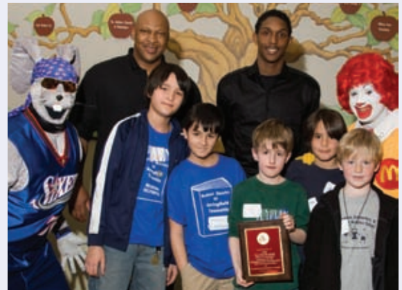
Erdenheim Elementary School, pictured above with Hip Hop, 76ers Basketball Ambassador World B. Free, 76ers star Lou Williams, and Ronald McDonald, was the top fundraiser this year in the 76ers Read for Ronald program. Thank you to the 76ers organization for their ongoing support.