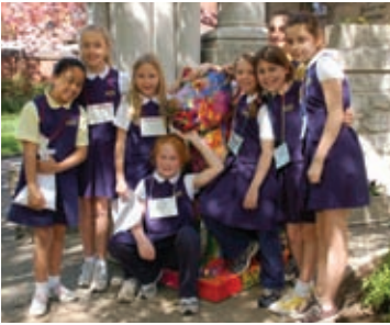
Students from Agnes Irwin Lower School, pictured, visited the House in April and brought many generous donations for our families, including money raised from selling friendship bracelets.

Thanks to the students of Penn Ryn, St. Denis, and Hillside Avenue Schools for their contributions to the House this spring, as well.