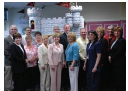
Our reopening week featured a reception thanking donors including the dedicated members of Katie's Crusaders.