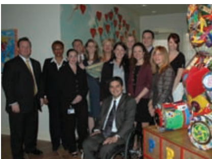
Our sincere appreciation to St. Christopher's Foundation for Children for designating PRMH as one of the beneficiaries of their annual Apple Blossom Ball in May. The Foundation's Board (pictured above) awarded a $100,000 operating grant for our Front & Erie House.

"Sometimes you feel like you are the only person going through this. Then you look around and see you are not the only one. You're not alone."