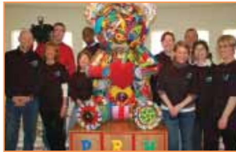
Comcast SportsNet employees pose for a photo after dropping off books for the new reading corner at Front & Erie. The book drive was part of Comcast Cares Day, Comcast's national, company-wide day of service in which tens of thousands of Comcast employees, along with their families, friends, and community partners worked together to make a difference in hundreds of communities across the country.