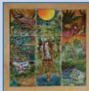
New Day Glass Panel by Rachel Shoham