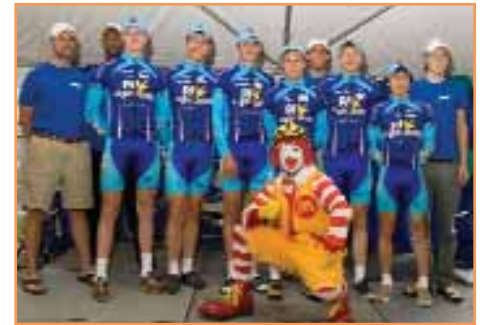
Local team PA Lighting, shown with Ronald McDonald, along with teams from all over the world joined PRMH and Pro Cycling Tour to kick off the Tour of Pennsylvania Cycling Race with a welcoming reception on June 23.

Thank you to our donors for this event: Taylor Rental Media/All Event Party Rental.com, Affairs To Be Remembered, A Fresh Focus Photography, Estate 12 Vineyards and Winery, Victory Brewing Company, Coca-Cola, Sweet Lucy's Smokehouse, Chili's Grill and Bar, A Full Plate Café, The Double Tree Hotel, Rita's Water Ice, PSAR, and the Philadelphia Fancy Brigades.