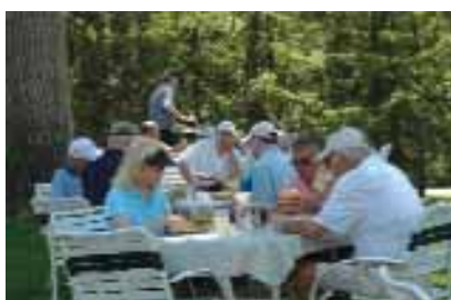
Golfers enjoy lunch before teeing off.