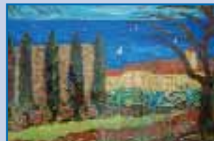
Riviera Villa with Sail Boats by Leslie Ehrin