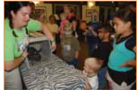
The Philadelphia Zoo returned to PRMH on September 24 bringing an assortment of live animals, including rabbit Lady Gray, pictured, through the Zoo on Wheels. The artists of Stacey's Face Painting transformed the children at the House into animals themselves and the Zoo Docents provided a delicious dinner. This is the second of the three PRMH visits by the Philadelphia Zoo as part of our ongoing partnership. The Zoo provides complimentary tickets to our families thanks to the generosity of an anonymous donor.