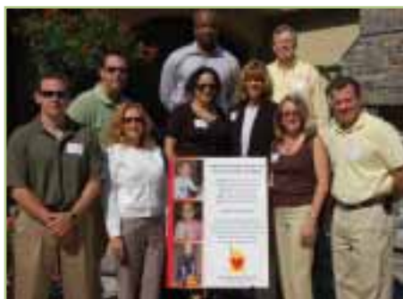
Employees from Bristol-Myers Squibb, pictured, were one of the many groups to volunteer their time at the Design Home.