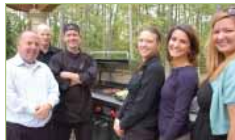
The team from Fleming's Prime Steakhouse in Radnor cooked up a delicious steak and eggs breakfast in the Design Home's outdoor kitchen at a special cooking seminar on September 25.