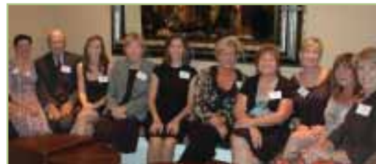
The members of the Philadelphia magazine Design Home 2008® Committee at the Design Home Patron Party.