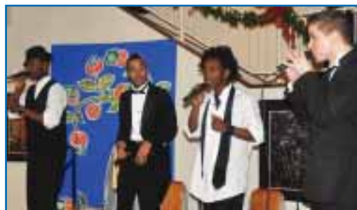
The band Odys performs at our Front & Erie Share A Night Celebration. Thank you to our many supporters who donated their time, services, and food to make our Share A Night events magical. For a complete listing of donors and event photos, visit our website at www.philarmh.org/share-a-night-celebration .