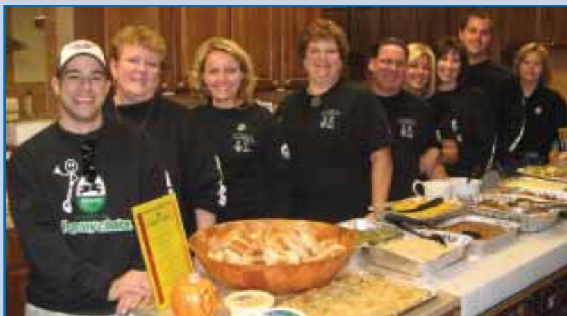
Volunteers from Keenan Auto Body, Inc. serve dinner to our families as part of the Guest Chef program at Front & Erie.

The volunteer's primary responsibility is to help the families in any way possible and to assist the House management staff. We count on you to use your own initiative. Make it your goal to be a genuine asset to the House and to our families. The more you are willing to give of yourself, not just your time, the more you will receive. Afternoon shifts are particularly needed from 1pm - 6pm.