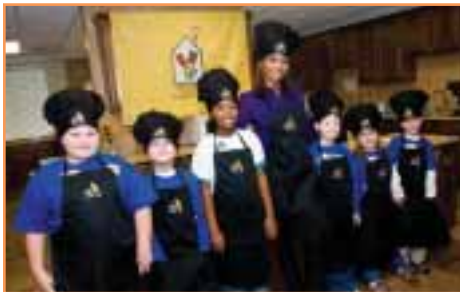
Actress Holly Robinson Peete, shown with students from Cornwells Elementary School, stopped by our Front & Erie House on November 10 to bake cookies with our families for World Children's Day.