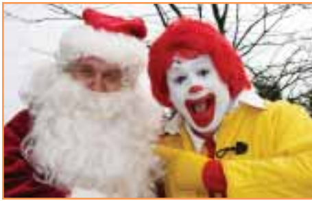
Santa and Ronald McDonald mingle at the County Corvette Fourth Annual Holiday Toy Drive on December 6 benefitting PRMH. This event brought in over $25,000 in toys for the children we serve as well as nearly $10,000 in monetary donations.

Thank you to County Corvette and all of the organizations and individuals who supported the House through toy and holiday wish list drives throughout the season. The toy donations ensure that all children and their siblings staying at the House receive a brand new toy upon arrival, as well as gifts during the holidays.