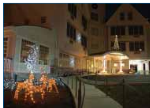
Our Front & Erie House adorned in lights for the first time.