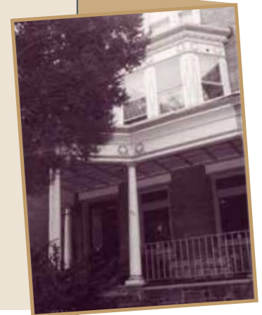
Original House on Spruce Street

Now: Today, we rely on our large volunteer corps to ensure the successful operation of our programs and truly view our volunteers as the heart of the House. Regularly scheduled volunteers staff the front desk, provide tours, drive our shuttle vans, assist with thank you letters, help in the kitchen, complete maintenance tasks, and support the House and families in a variety of other ways. In addition, volunteers prepare and serve breakfast and dinner to our families as part of our Guest Chef program which operates 365 days a year.