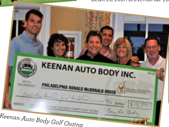
Keenan Auto Body Golf Outing