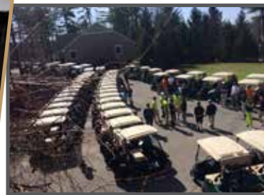
CJR Memorial Foundation Golf Invitational