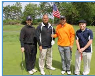
Sean M. Morris Memorial Tournament