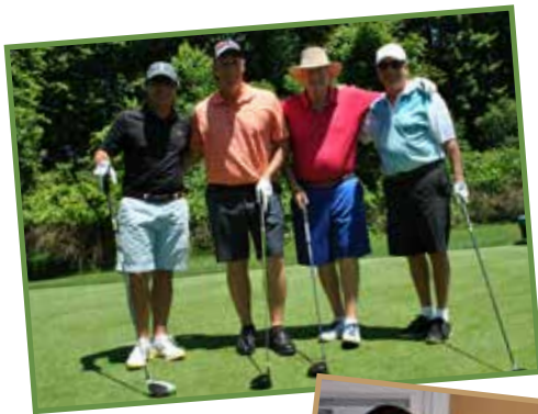
Audi Quattro Cup

It was an incredible spring and summer filled with golf outings benefitting the House and the thousands of families we serve each year. Thank you to everyone who participated in a golf tournament for your generosity and belief in our mission of supporting families of seriously ill children by creating a community of comfort and hope.